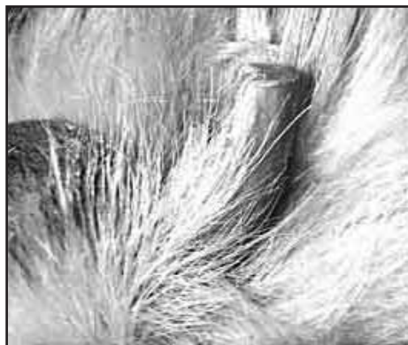
The pretty one!