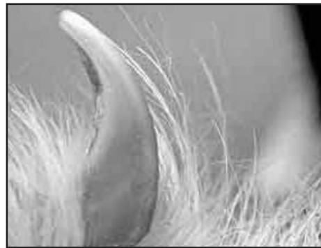
An unclipped nail.

Not one to shy away from pushing my luck, I then approached our German Shepherd, Sam, who has never let anyone but a professional (our vet) touch his feet. No way! I promptly got a look that clearly said, "I'm no Golden Retriever, don't even think about using that thing on me." Oh well, two out of three dogs is not a bad conversion rate. We're happy, the Golden's are happy—and we hear a lot less "click, click, click" when doggie paws are crossing our uncarpeted floors.