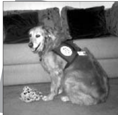
Wrigley the Therapy Dog